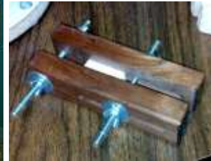
Jig for small complex sawing