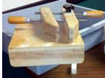
EZ-Mount Clamp on flat surface

Others had tips and stories that helped, entertained, and even alarmed us. (If you weren't there, ask someone about the feeding the dog story).