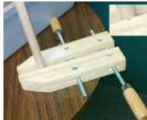
Center hole on dowel jig