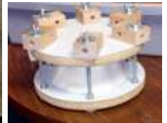
Glue press for various sized bowls & baskets

Swede sent along a variety of clamping jigs. Note the V-cut on the dowel jig for drilling a center hole.